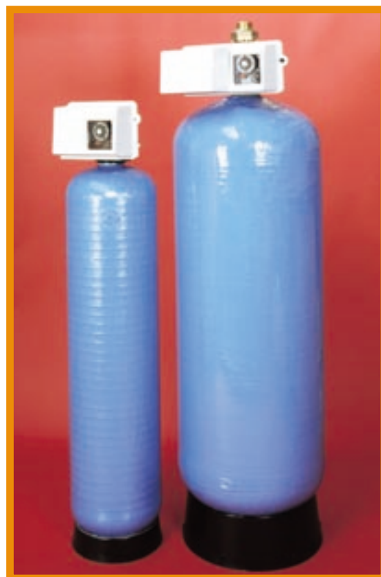
Fleck 2510 & 2750 Valves illustrated

General turbidity removal at high flows can be